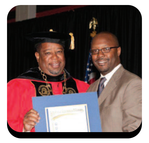
President receiving proclamation from the Fulton County Commissioners Office